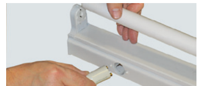
Isolate power, remove starter and T8 lamp and recycle