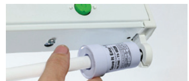
Completing the installation