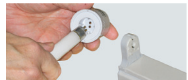
Fix Save It Easy® to T5 lamp and install all components